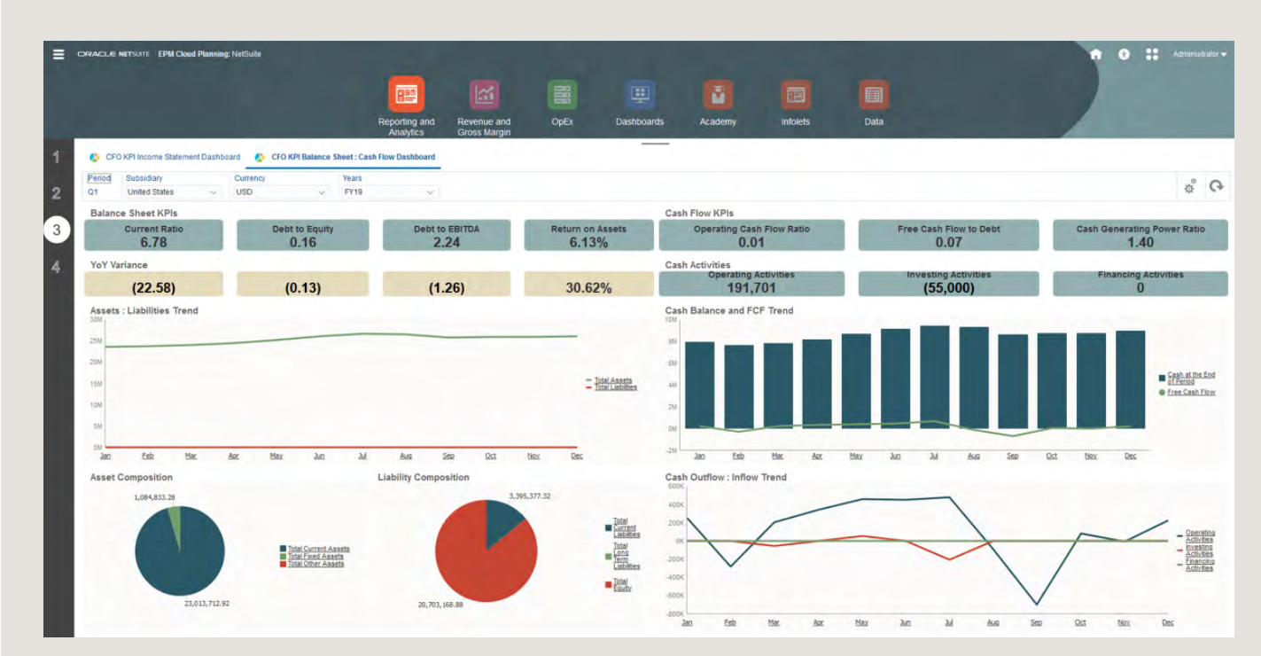
Pre-built dashboards make it easy to quickly visualise your actuals-to-budget trending in real-time.

Create dashboards that display budget and actual data in minutes. Any change made are instantaneously reflected. The drag-and-drop dashboard designer puts powerful, yet easy-to-use, web-based reporting into the hands of finance and budget owners providing a secure, collaborative and process-driven approach for defining, authoring, reviewing, and publishing financial and management reports.